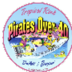
Friday Night Headlining Band